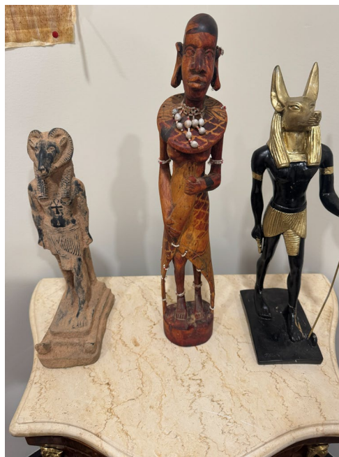
LEFT- AMUN FOUND IN TOMB OF RAMESES V (AND STOLEN BY WORKER