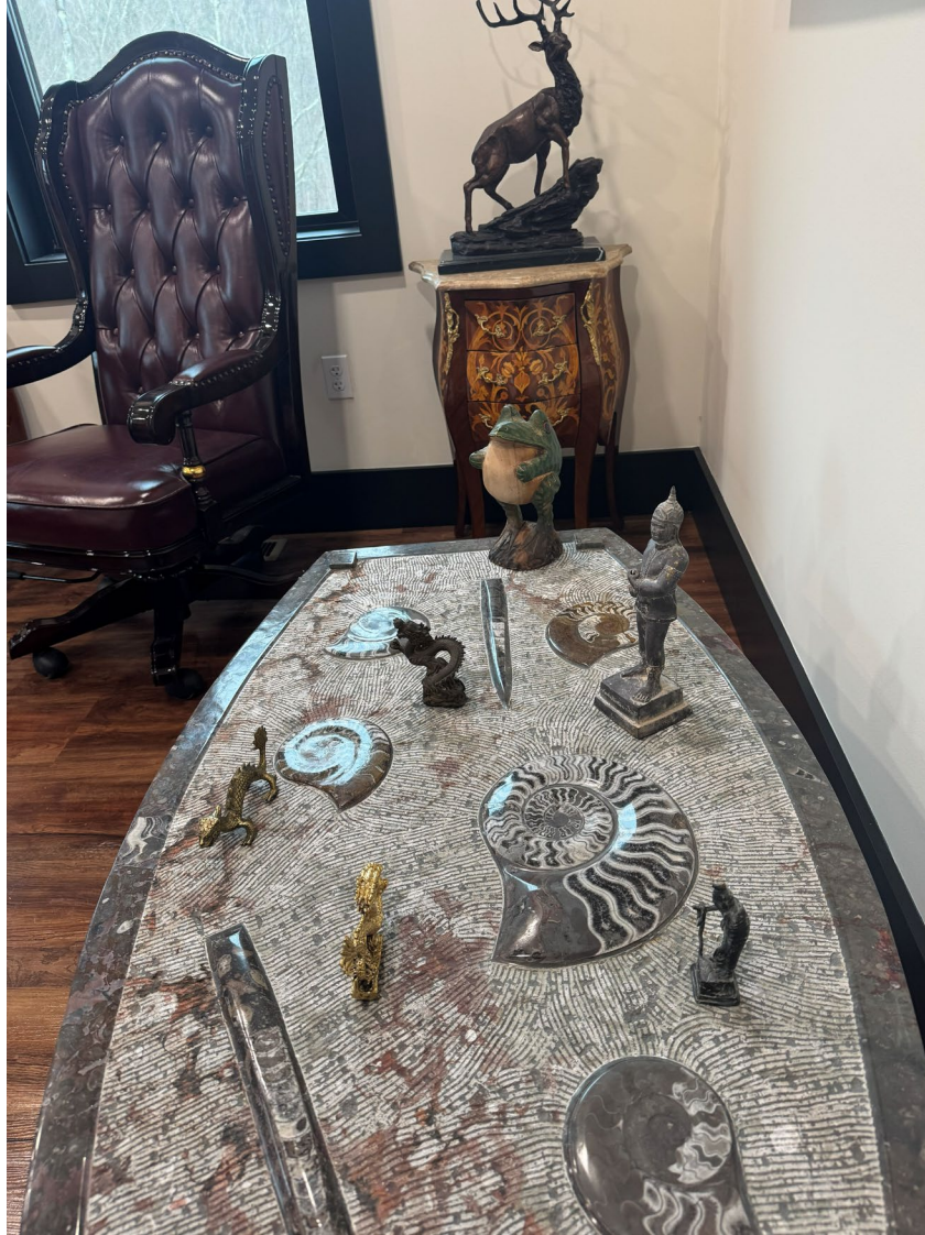
MORROCAN LIMESTONE WITH EMBEDDED AMMONITES AND SQUID- 250 MILLION YEARS OLD