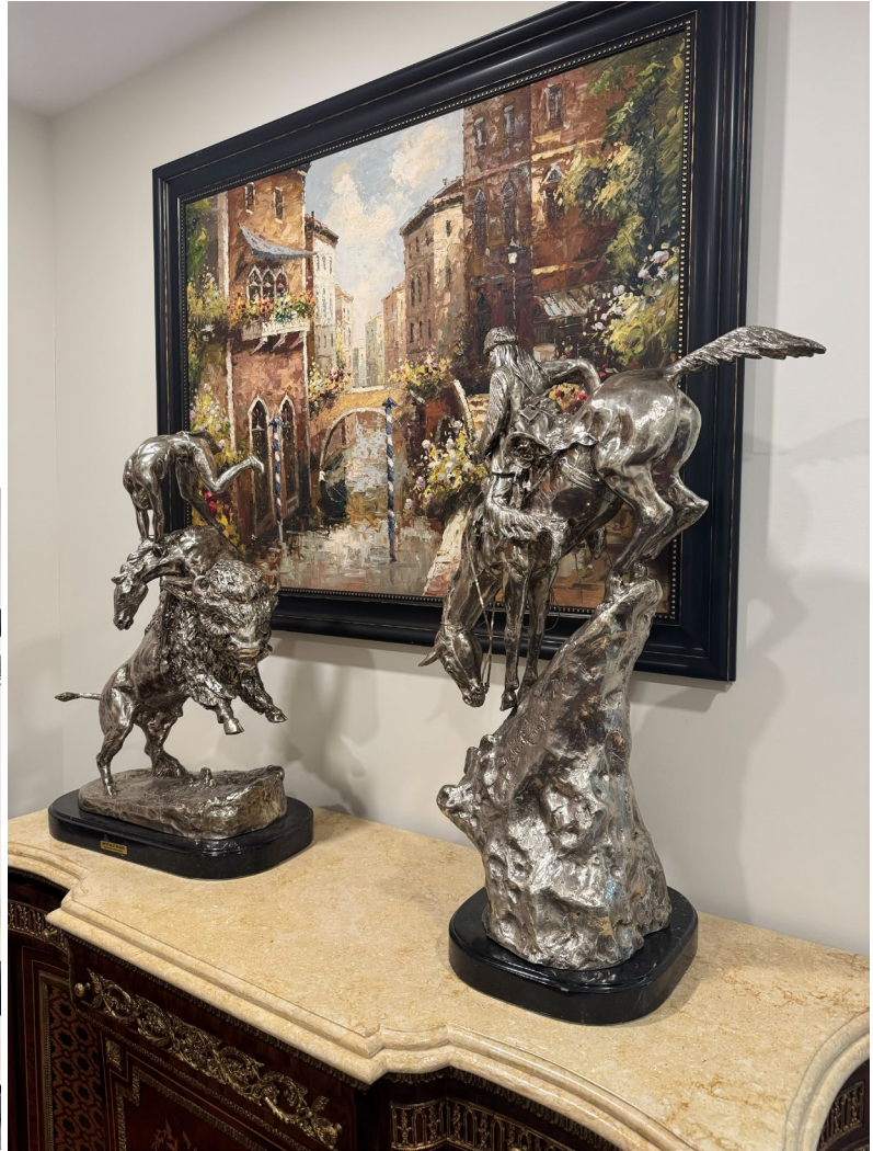
BRONZE BY FREDERICK REMINGTON