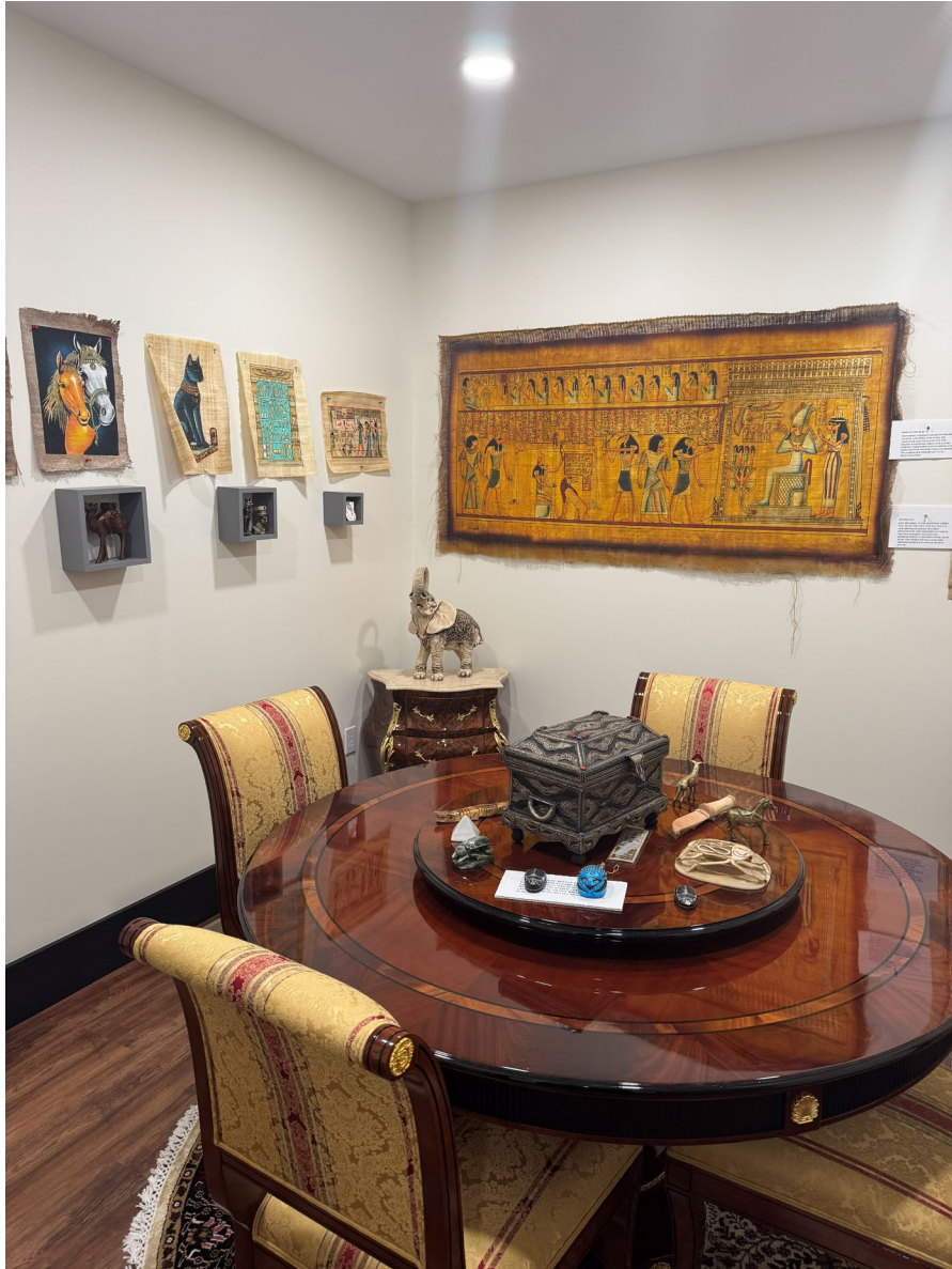
EGYPT ROOM WITH MUSEUM QUALITY PAPYRUS